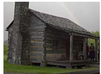
Children have pioneer experiences at Crockett Days Camp on June 23-27.