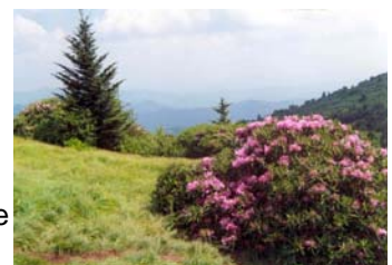
Blazing colors pop during the Rhododendron Festival at Roan Mountain.

The 62nd annual Roan Mountain Rhododendron Festival at Roan Mountain State Park features the world's largest natural rhododendron gardens. Free demonstrations and entertainment will be featured in the park amphitheater all day both days. A variety of arts, crafts, food and drink will be available. Sponsored by the Roan Mountain Citizens Club, the festival is nationally known and happens to be a favorite stopping point along the Appalachian Trail. The rhododendrons achieve peak bloom each year in mid-June. Bring the family for a weekend of fun, food, crafts, mountain music and clogging in the friendly village of Roan Mountain. For more information contact Donna McKinney at (423) 772-3303.