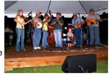
Performers and guests have a blast during the festival at Big Ridge on August 15.