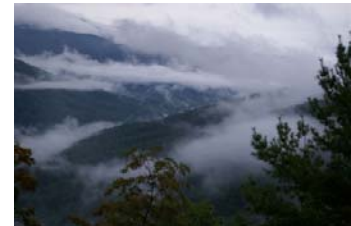
Scenic Frozen Head State Park celebrates traditions on August 16.