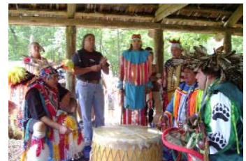
Experience living history during Cherokee Days of Recognition at Red Clay State Park on August 2-3.