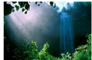
Enjoy the scenic views at the 30th annual Mountaineer Folk Festival at Fall Creek Falls on September 5-7.