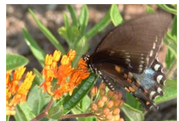
Hikes and native plant gardening are part of hands-on activities during the festival at Burgess Falls on August 9.

For more information contact Bill Summers at (931) 432-5312.