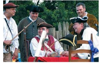
Liberty: Saga of Sycamore Shoals is the must-see drama event in northeast Tennessee.