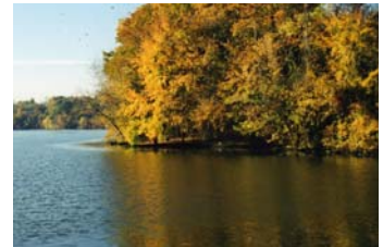
Bledsoe Creek is a popular location during the Fishing Rodeo on June 7.