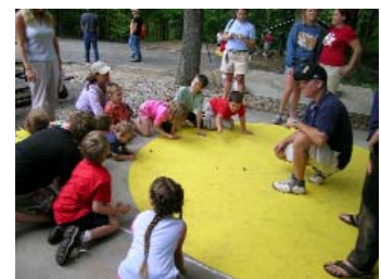
Youngsters learn the art of Rolley Hole at Standing Stone State Park.