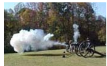
Celebrate Independence Day with a bang at Fort Pillow State Park.

For more information contact Robby Tidwell at (731) 738-5581.