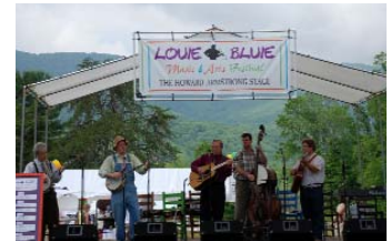
Regional music draws the crowds at the Louie Bluie Music and Arts Festival on June 14.