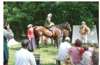
Trails and Tennessee history complement David Crockett Days in Lawrenceburg.