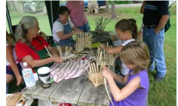
Craft demonstrations are just one of the fun events at the Warriors' Path Folk Festival on July 26.