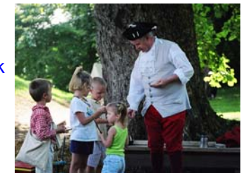
Fort Loudoun comes alive as a trading post and early British frontier fortification on September 6-7.